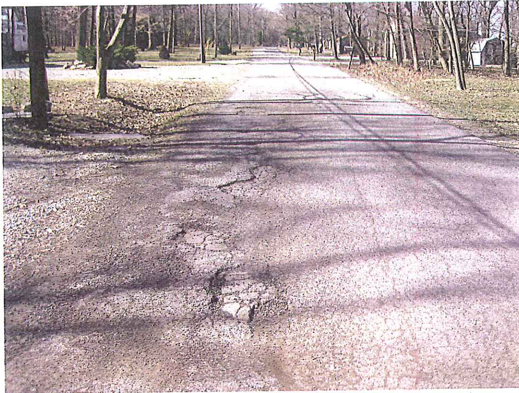
Picture 7 – Pavement Segment 313 (3206 Memorial Shoreway) CONDITION RATING NUMBER 1