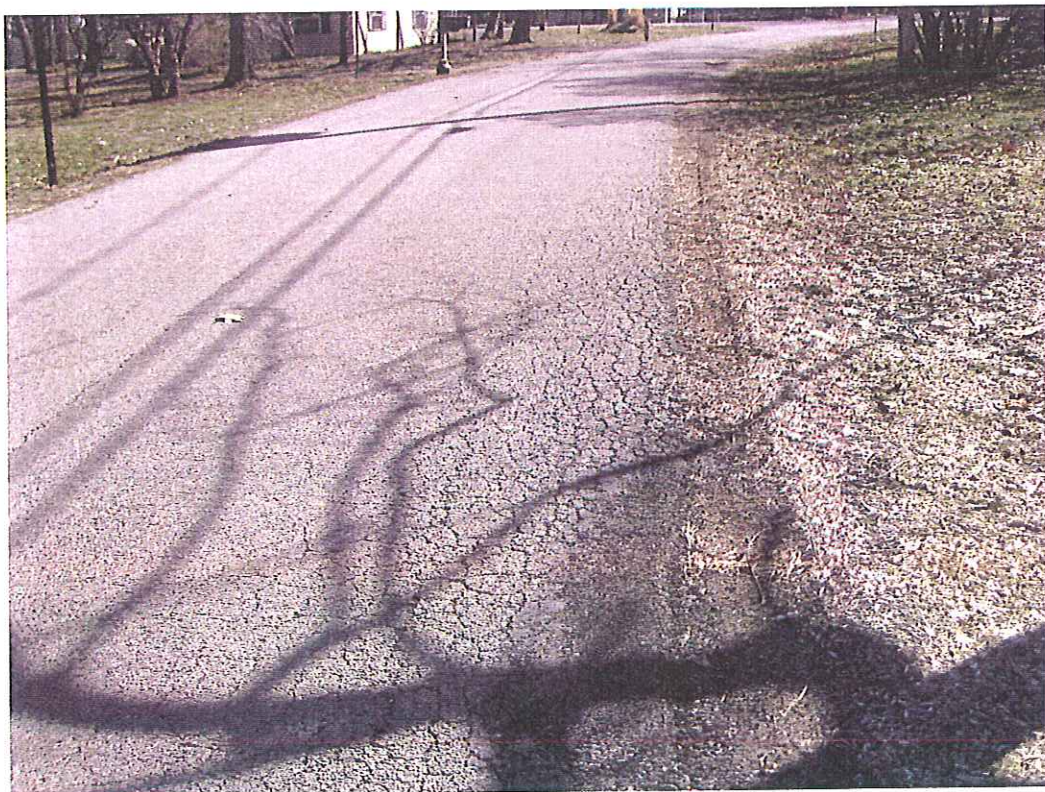
Picture 4 – Pavement Segment 306 (3116 Memorial Shoreway)