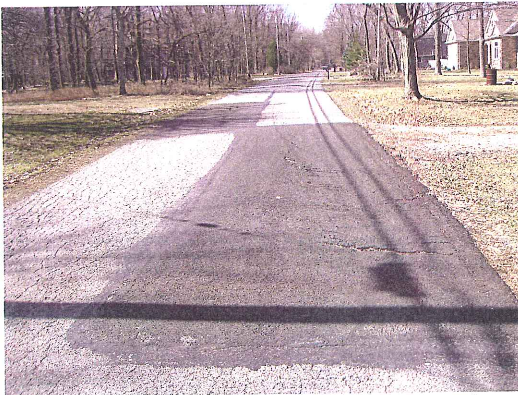
Picture 10 – Pavement Segment 317 (3274 Memorial Shoreway) CONDITION RATING NUMBER 1