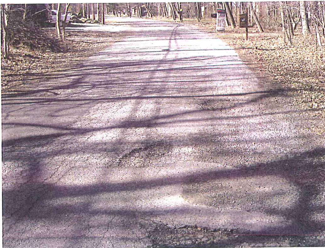
Picture 6 – Pavement Segment 311 (3182 Memorial Shoreway) CONDITION RATING NUMBER 1