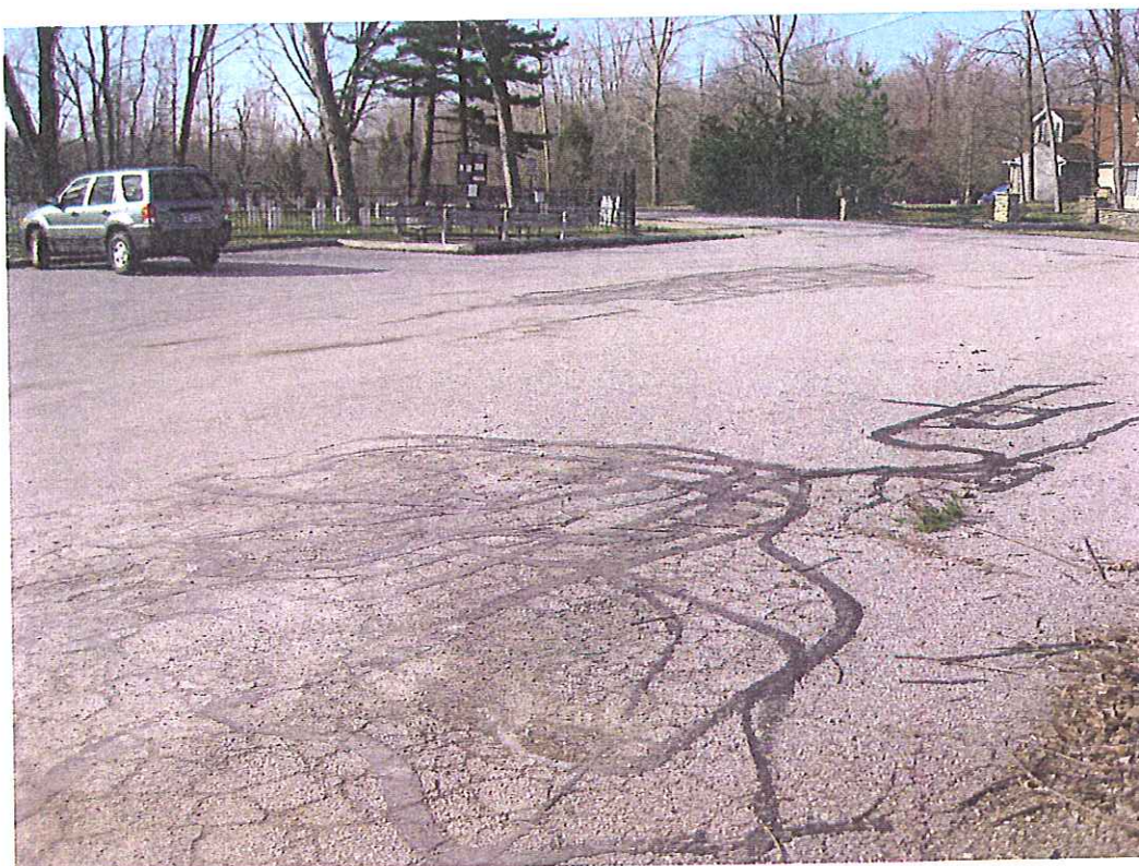
Picture 1 – Pavement Segment 410 (South Confederate at Parking Area)