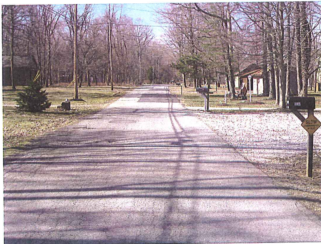
Picture 8 – Pavement Segment 311 (3234 Memorial Shoreway) CONDITION RATING NUMBER 1