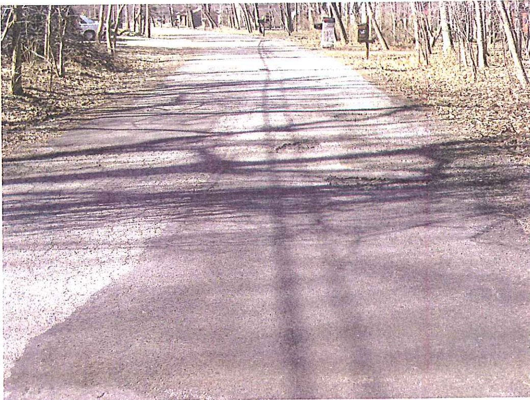
Picture 5 – Pavement Segment 311 (3168 Memorial Shoreway) CONDITION RATING NUMBER 1