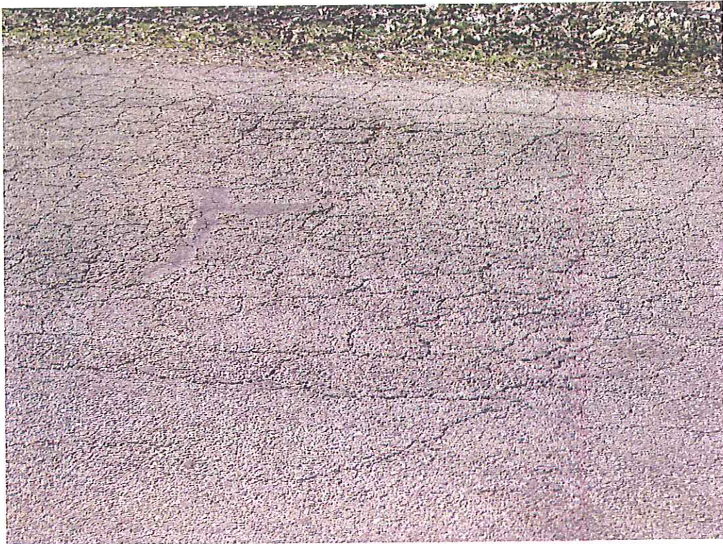
Picture 3 – Pavement Segment 305 (3100 Memorial Shoreway)