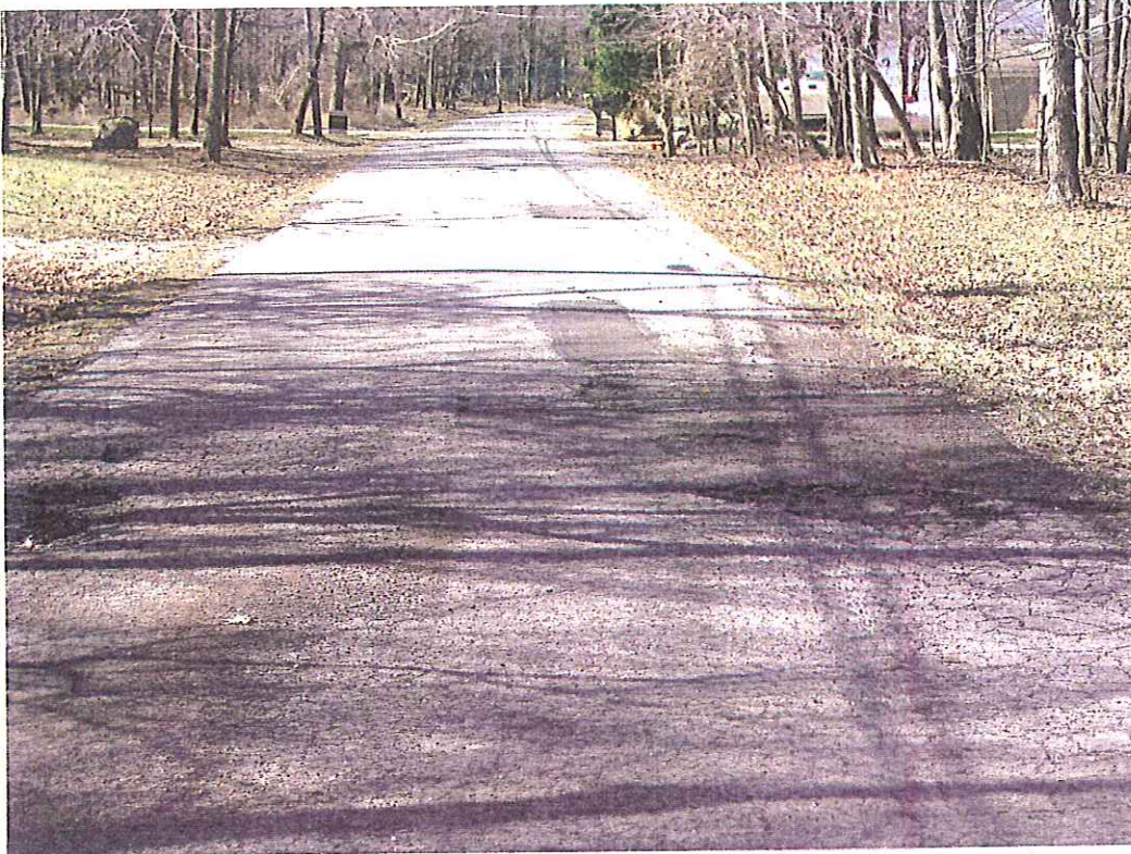
Picture 11 – Pavement Segment 321 (3366 Memorial Shoreway) CONDITION RATING NUMBER 3